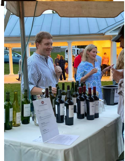
Taste of Highland 2021