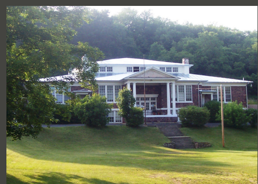
The Highland Center today

We will celebrate the rich history of the building starting at 6pm on Saturday, August 13th with