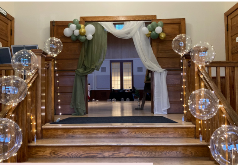
Highland High School Jr/Sr Prom