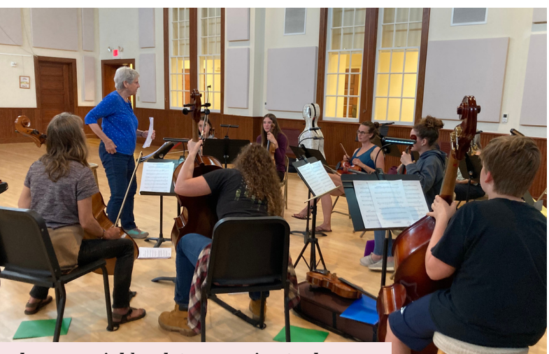
The new Highland Community Orchestra

The Highland Center exists because of Highland County and for Highland County.