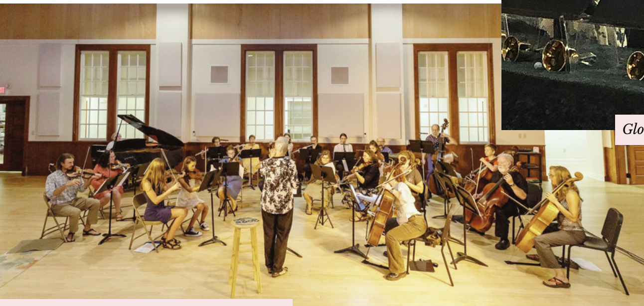
Highlands Community Orchestra